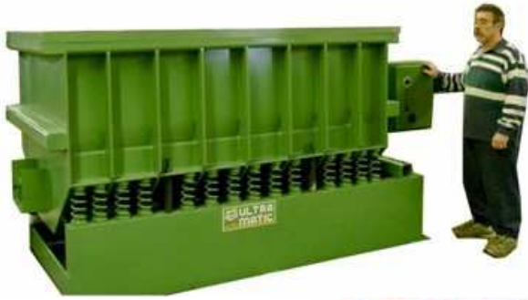
MODEL OHD 4080S 52 CU. FT. CAPACITY With TUB DIVIDERS