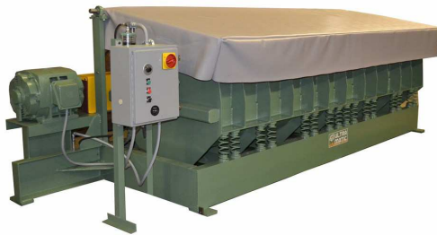
MODEL OHD 36144 With Sound Cover